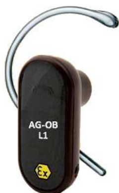
Headset Atex AG-OBL1

The AG-SMART01 also has Push To Talk functionality.